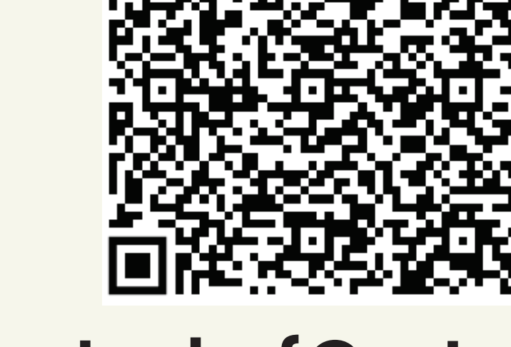
Lack of Control Over Land